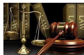
The legal procedure p. 6