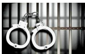
Introduction p. 1