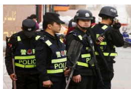
Overview of the law p. 2